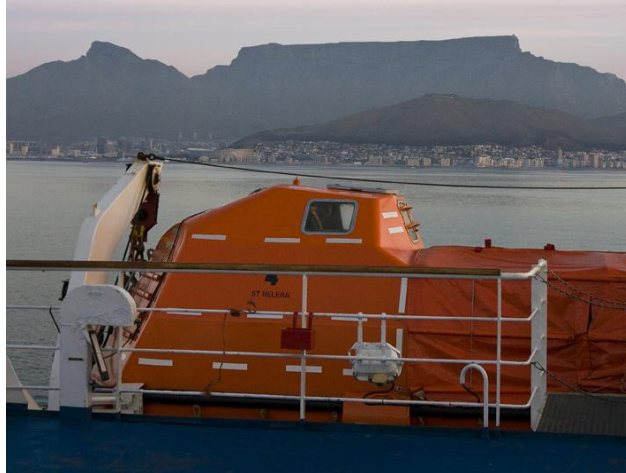
Goodbye to Table Mountain!

We boarded the RMS in Cape Town, and set sail on the evening tide of 8 th October. After sighting a few friendly dolphins, seals and cormorants we had few fellow travellers for the next five days!