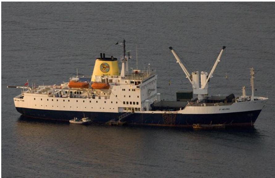
RMS St Helena

The Royal Mail Ship St Helena was built in 1989 specifically to supply the island of St Helena, a British Overseas Territory deep in the tropical South Atlantic. She is British registered, 6,767 gross tonnes and has berths for a maximum of 128 passengers plus 56 officers and crew.